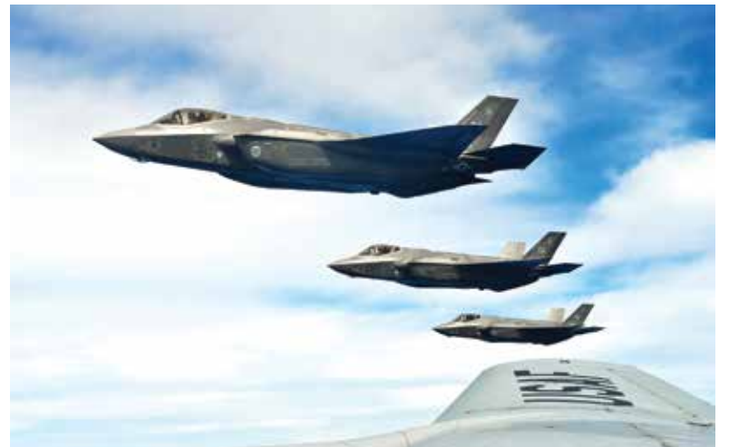
There's an ongoing review of Canada's acquisition of 88 F-35 fighter jets from Lockheed Martin.

For anyone about to argue against Canada operating a mixed fleet of fighter aircraft, the Royal Canadian Air Force used to do just that only a couple of decades ago. During the transition from CF-104 Starfighters to