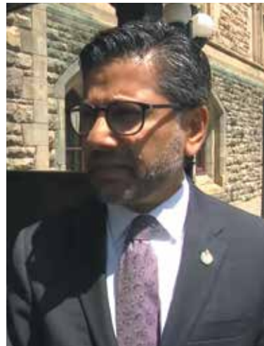
Liberal MP Yasir Naqvi says the settlement demonstrates the need for both journalists and politicians to 'do their due diligence' in responding to allegations of foreign interference.

then-Liberal MP had "privately advised a senior Chinese diplomat in 2021 that Beijing should hold off freeing Michael Kovrig and Michael Spavor."