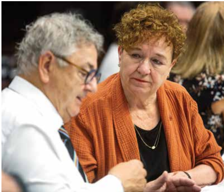
ISG Senator Yvonne Boyer says she hopes the current iteration of Bill S-228 will move from the Chamber to the House ‘very soon,’ as she has been ‘working on [it] for a number of years.’

For Boyer, the fight to get this legislation passed stems from personal roots, with her aunt having