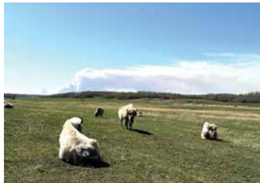
Métis Crossing in Alberta, with the Sturgeon County wildfire burning nearby on May 6, 2025.

But as people flee their homes and firefighters battle blazes around the clock, promised funding for emergency management has not found its way to Métis communities. The previous