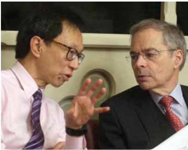
Independent Senator Yuen Pau Woo, left, pictured with Bill C-202 sponsor Progressive Senator Pierre Dagher in 2018, says taking supply management off the negotiation table will come back to hurt Canada.

“They were emphatic in their foolishness,” he said. “I accept the complementary [role of the Senate] ... we understand the importance of the elected Chamber.”