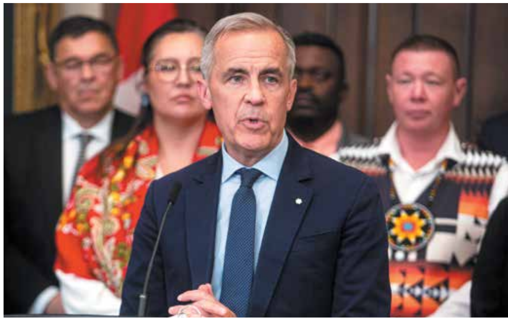
Amid growing threats of a renewed Idle No More summer, Prime Minister Mark Carney held a press conference following Bill C-5’s passage through the House of Commons on June 20 to clarify and emphasize that ‘free, prior, and informed consent’ is ‘embedded in the plan.’

Carney has attempted to emphasize the importance of Indigenous consultation and