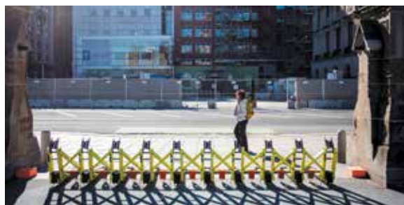
The Block 2 construction site is blocked off by fencing along Wellington Street, as seen on March 27.

The Core Area Plan includes the NCC's "long-term intentions and broad policy directions" for the precinct and other central areas. Among the items on the NCC's wish list is to "integrate tram-based public transit, cycling and civic spaces into a high-quality Confederation Boulevard streetscape environment" along Wellington Street. It also wants to save the vacant land on Wellington Street between the Justice Building and the Supreme Court "for a future landmark building to complete the Judicial Triad."