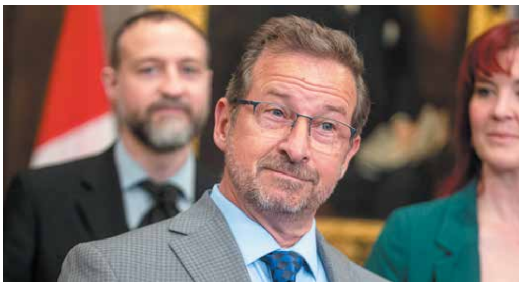
Bloc Québécois Leader Yves-François Blanchet introduced Bill C-202 in the early days of the new Parliament after a previous version died on the Order Paper in the last one.

Barring supply management concessions in trade talks is widely politically popular, but has been subject to vocal criticism in trade circles.