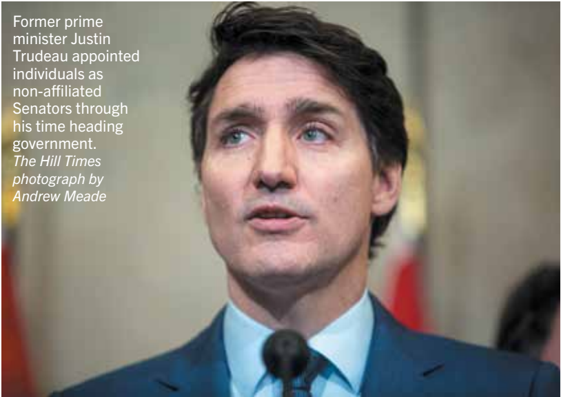
Former prime minister Justin Trudeau appointed individuals as non-affiliated Senators through his time heading government.

joining the caucus, Housakos said “it’s not an insignificant amount ... I can tell you it’s a fistful.”