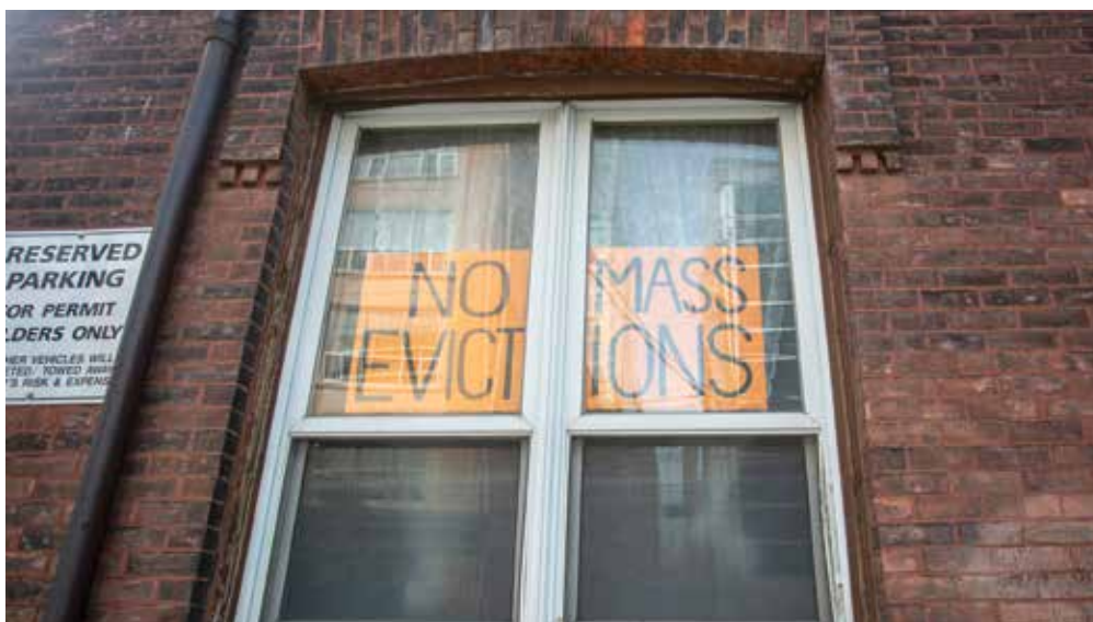
A rental building at 178 Nepean St. in Ottawa on Aug. 6, 2024.

ing moment we're in, one where our entire nation is focused on securing our economic future and quality of life. Whether it's attracting investment, ensuring labour mobility, or improving productivity, housing is what makes economic growth and transformation possible.