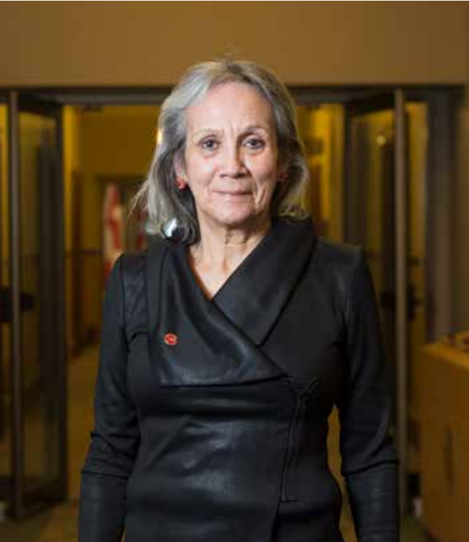
Manitoba Senator Mary Jane McCallum announced her decision to join the Conservative caucus on June 10.

It’s a return to the caucus for Smith, who was appointed as a