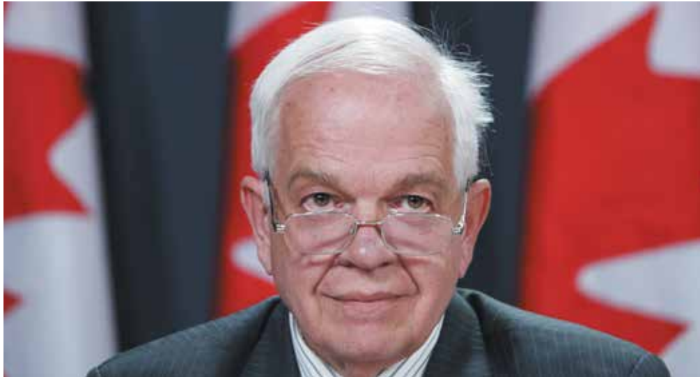
Then-immigration minister John McCallum in 2015. McCallum died on June 21 in Mississauga, Ont., at the age of 75.

A humble public servant with a sense of humour is how many former colleagues as well as his family are remembering ex-Liberal cabinet minister John McCallum who died on June 21, aged 75.