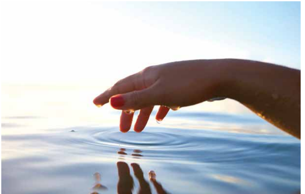
To secure Canada's national water and economic security, we need coherent federal-provincial partnership and barrier-free markets, writes Soula Chronopoulos.

Last year, the federal government took a major step towards addressing the co-ordination of Canada's water issues with the creation of the Canada Water Agency (CWA).