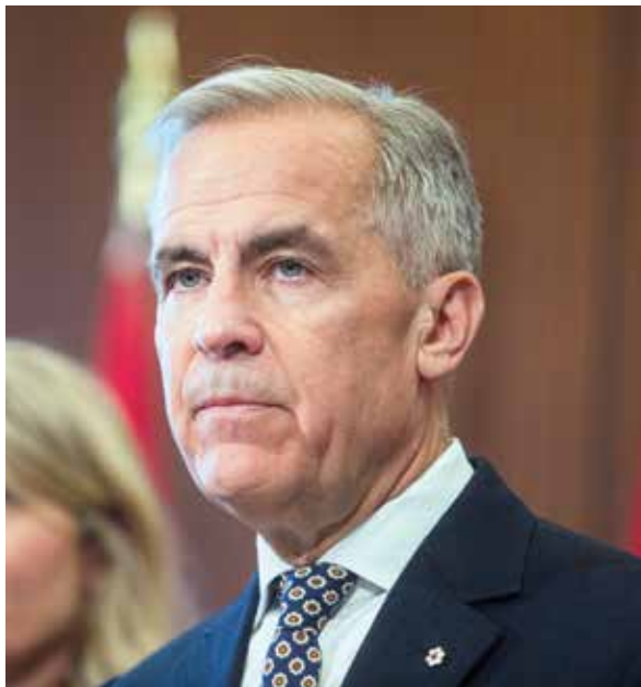
Prime Minister Mark Carney, left, and Housing Minister Gregor Robertson committed to bring in a housing plan with a level of ambition not seen since the Second World War, write Housing Canada Coalition representatives.

We need a Team Canada effort that draws on the unify-